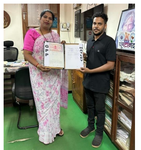
GOA ENEGRY DEVELOPMENT AGENCY