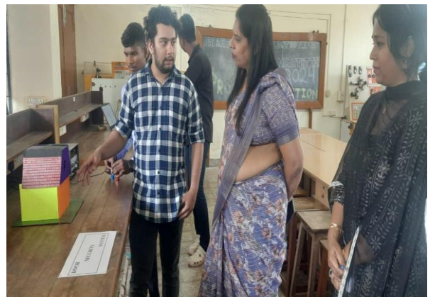
Project exhibition by students of Second Year and Final Year Electronics and Instrumentation.